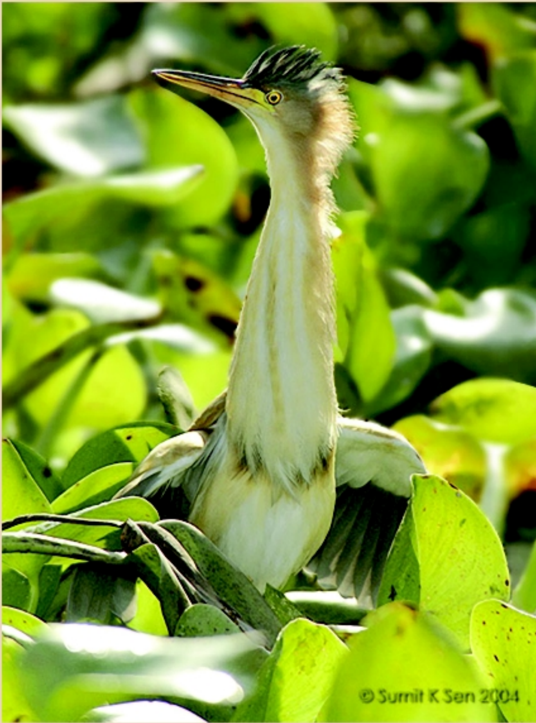
Yellow Bittern Ixobrychus sinensis